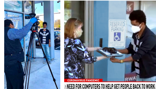
WJLA interviews a socially-distanced student as he picks up a laptop from CORE's Director.

Sept. 28 | Virginia Adult Learning Resource Center at VCU began partnering with CORE to provide a course called Code Beats —using hip-hop music to teach basic coding with the idea of drawing more people in by making it fun. Computer CORE can then offer follow-up curriculum to teach the skills needed to get into programming jobs.